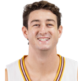
11 CLOUT Sr. ▶ Forward

MIN. 27.6 PPG 20.0 RPG 6.5 APG 0.5 FG% 41.7 3FG% 30.8