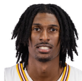
7 BERRY Sr. ▶ Forward

MIN. 31.7 PPG 10.0 RPG 1.5 APG 5.0 FG% 24.0 3FG% 20.0